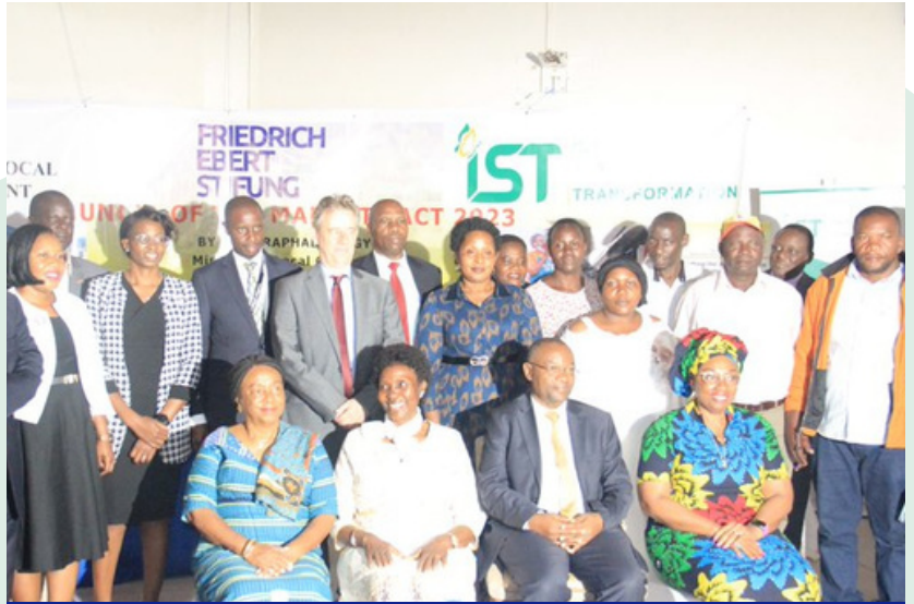
Stakeholders at the launch of the Markets Act. 2023 at Fair Way Hotel

IST's partnerships with Development partners like FES, UAF, OXFAM, and UN Women facilitated a multi-level dialogue engagement with a wide range of stakeholders that included government agencies, market leaders, and community representatives. This broad engagement was essential in advocating for a comprehensive review of the existing law, and ensuring that diverse perspectives were considered in the reform process.