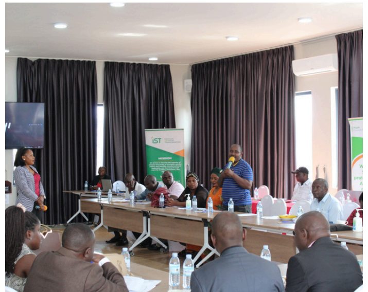
Stakeholders' sensitization engagement

Through various initiatives, IST sought to create a comprehensive platform for dialogue and action that would facilitate a new legislative framework better suited to the needs of Uganda's informal economy by engaging in consultations with market vendors, civil society organizations (CSOs), policymakers, and relevant ministerial agencies. This process not only aimed to repeal the old law but also to create a more inclusive framework that integrates the perspectives and needs of both male and female vendors.